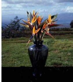
Goble Flower Farm Tropical Basket, Dendrobium and Bird of Paradise arrangements

loan was of significant value to his operation, Woody took time out to learn about and participate in other programs available through FSA.