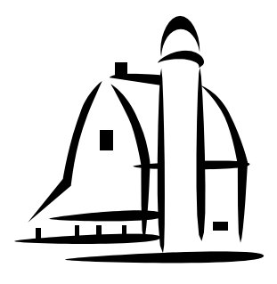
Gratiot County USDA Service Center