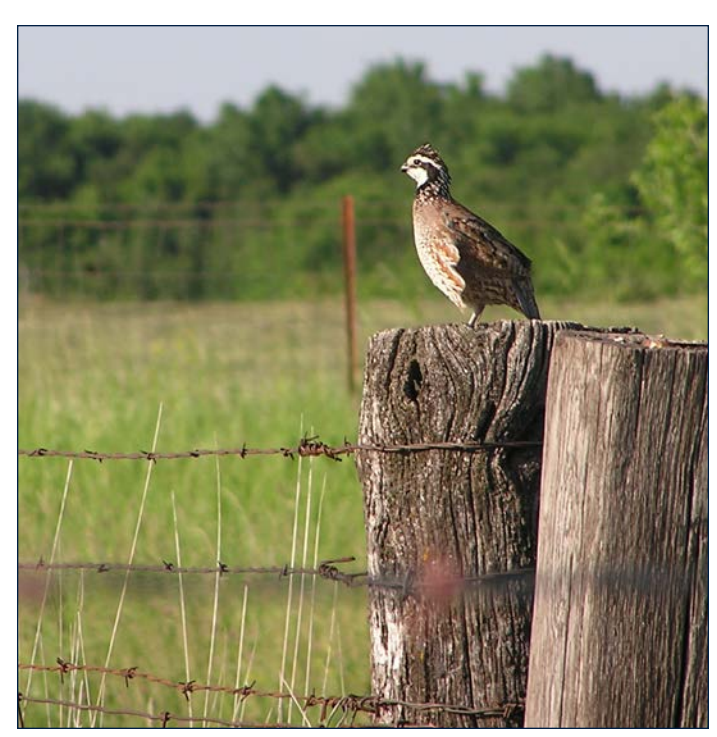
Male bobwhite quail.

Resources Conservation Service (NRCS) or a technical service provider. The conservation plan will provide details on how to plant, establish, and manage habitat for Northern bobwhite quail. Offers must be at least 5 acres or larger. All offers will provide nesting and early successional habitat. Nesting cover must be a mixture of native grasses and forbs. Early successional habitat will be created by seeding 25% of the offer to annual plants in year one, to be left fallow and unharvested for two growing seasons. Annuals, usually small grains, are required to be reseeded in years 4, 7, and 11 based on contract length. Winter food plots, edge feathering, and shrub plantings are allowed to enhance benefits, but not required. After the habitat is established, it will need to be maintained and managed by prescribed burning, spraying, grazing, interseeding or disking on the nesting habitat acres. Planting annuals on the early successional habitat locations will meet required management activities on those acres. Proper habitat establishment, maintenance, and management will maximize benefits for Northern bobwhite quail.