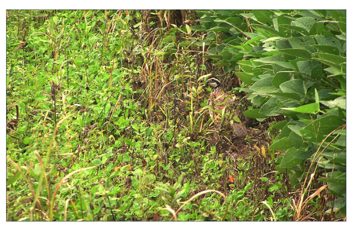
Iowa Early Successional Quail SAFE site, nesting habitat adjacent to brood habitat.

This fact sheet is provided for informational purposes only; other restrictions or requirements may apply. Consult your local FSA office for details. For more information, contact your local service center and USDA Farm Service Agency office: farmers.gov/service-locator or nearest DNR office: iowadnr.gov/crp.