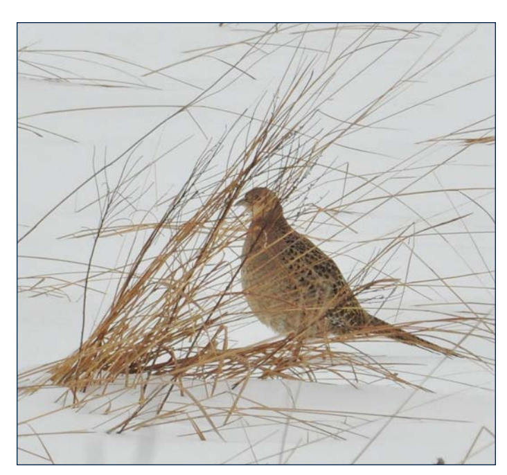
Female ring-necked pheasants in poor winter habitat.

a conservation plan with assistance from the Natural Resources Conservation Service or a technical service provider. The conservation plan will provide details on how to plant, establish, and manage habitat for ring-necked pheasant. Offers maybe anywhere from 20 to 160 acres in size. All enrolled offers will provide nesting cover, winter cover and a winter food plot. Nesting cover must be a block of mixed native grasses and wildflowers minimum of six species, more diversity is encouraged. Winter cover will be a block of switchgrass, minimum 25% of offer not to exceed 20 acres. Minimum winter food plot size is 2 acres with maximum size of 5 acres and plot(s) cannot exceed 10% of total contract acres. Shrubs/shelterbelts are allowed but not required. After the habitat is established. it will need to be maintained and managed by prescribed burning, grazing, interseeding or disking on nesting and winter habitat acres. When managing nesting cover, a diverse native plant community, it is recommended to avoid spraying herbicide. Proper habitat establishment, maintenance, and management will maximize benefits for ring-necked pheasant.