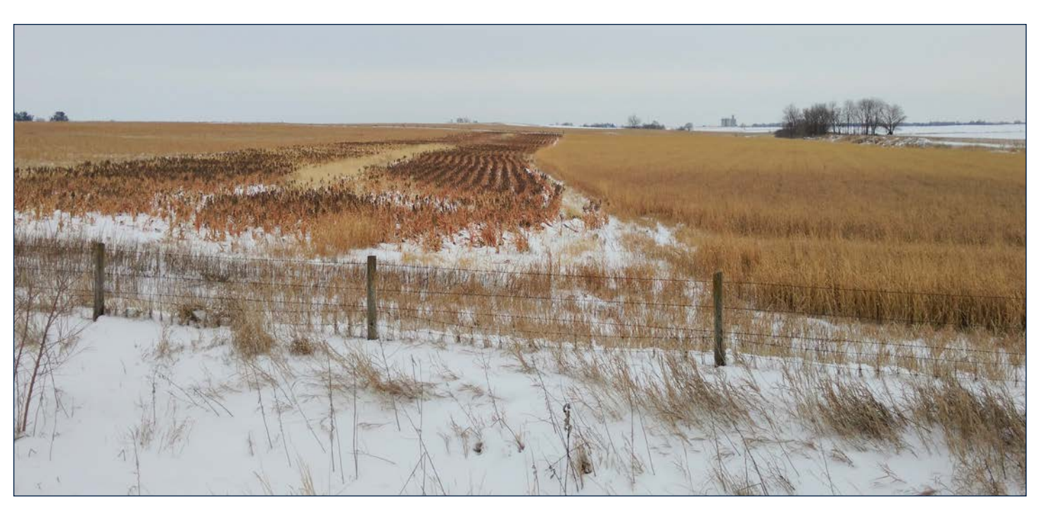
Iowa Pheasant Recovery SAFE site, switchgrass, food plot, and nesting habitats.

This fact sheet is provided for informational purposes only; other restrictions or requirements may apply. Consult your local FSA office for details. For more information, contact your local service center and USDA Farm Service Agency office: farmers.gov/service-locator or nearest DNR office: iowadnr.gov/crp.