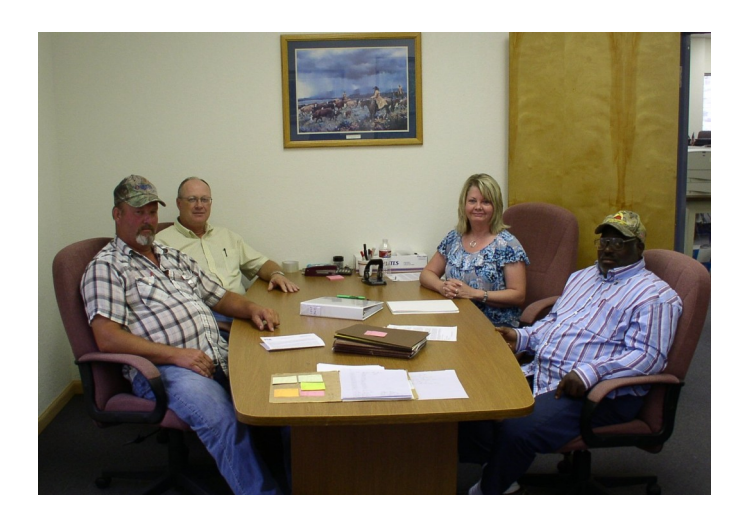
Butler County, MO County Committee

It's county committee nomination time and counties across the nation are reaching out in their communities for a diverse group of nominees. Butler County, Missouri, has seen firsthand the benefits of their outreach efforts. During the 2010 election, two minorities were elected to serve as members of the committee, making it the first time the county has not had to identify a minority advisor.