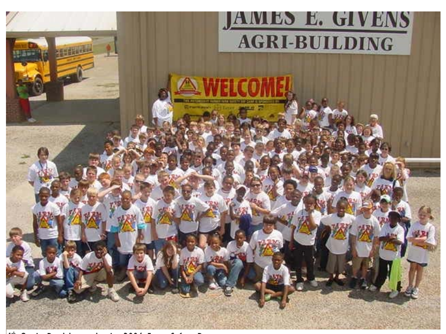
4th Grade Participants in the 2006 Farm Safety Day

A hamburger meal with all the fixings was provided by the Lawrence County Cattleman's Association .