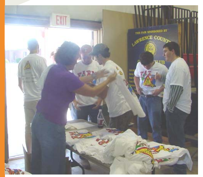
FFAers sort T-shirt before buses arrive