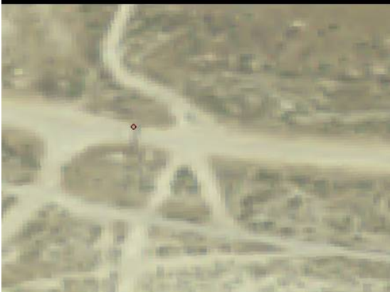
N Edge Cattle Guard