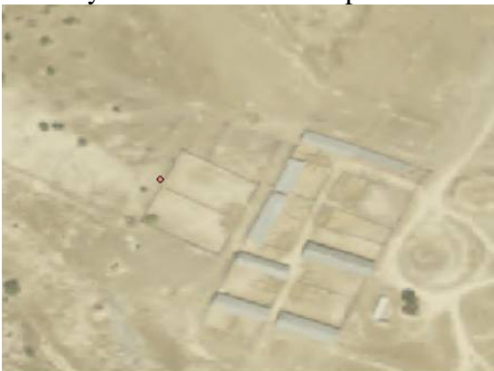
Corner Corral Fence

Below are examples of photo identifiable control points on 1-meter resolution imagery at a variety of scales. The examples are for display purposes only.