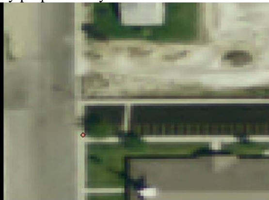
Corner Sidewalk & Grass