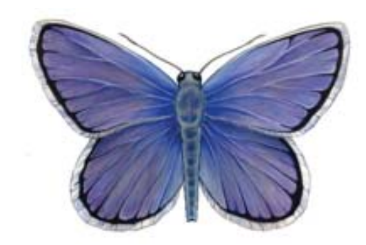
Karner blue butterfly (Lycaeides Melissa samuelis)