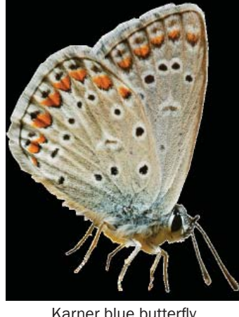
Karner blue butterfly (Lycaeides Melissa samuelis) underside of wing