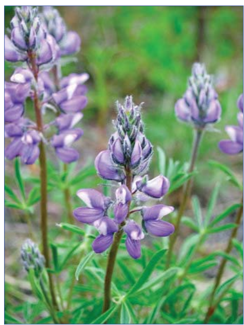
Wild Blue Lupine (Lupinus perenius)

The purpose of this practice is to restore the functions and values of the Karner blue butterfly habitat while reducing soil loss and sedimentation, improving surface and groundwater quality, and enhancing wildlife habitat on land retired from agricultural production.